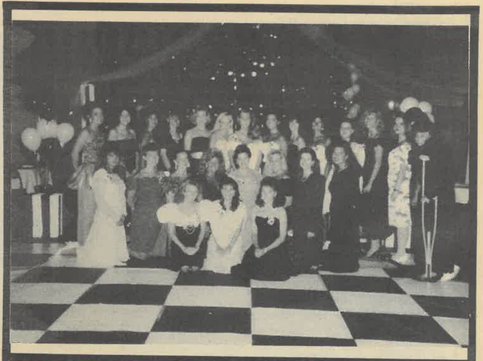
Members of Phi Sigma Sigma sorority at their annual pref night during this years rush week.